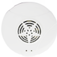
CH 2 O Detector