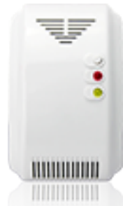
Fuel Gas Detector