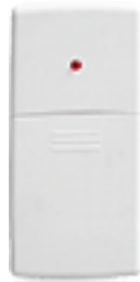
Door Sensor Detector