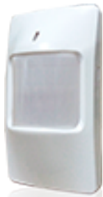
IR Motion Detector