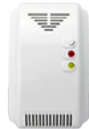
Fuel Gas Detector