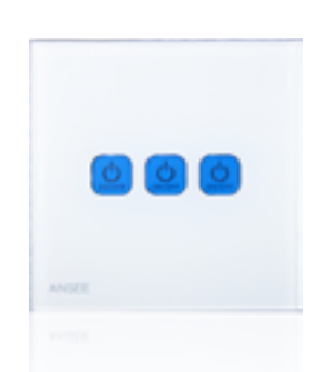
Smart Light Switch